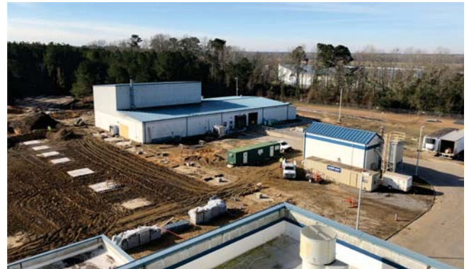
Subgrade & footings of the Logistical Building near the Jacket Plant.