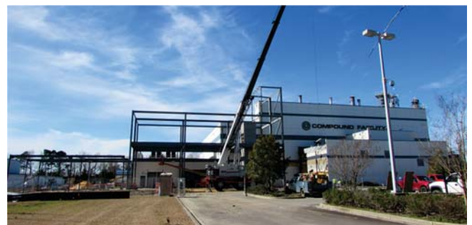
Building steel erection at the Compound Plant.