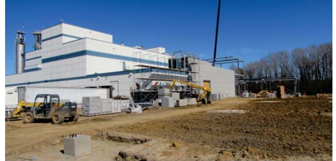
Installation of firewall between existing compound bldg. and logistics bldg.

Through our efforts of continuous expansions and modernizations, Okonite has you covered.