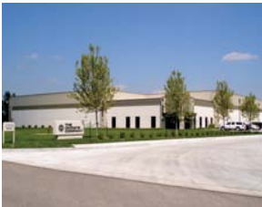
Kansas City, KS