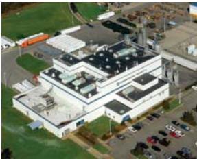
Orangeburg, SC - Compound Facility