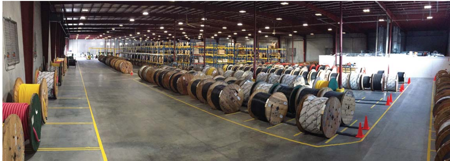
Our modern warehouse (top left and right photos) can now stock the cable for the growing needs of our customers.

Okonite continues our long-standing commitment to maintain inventory and to provide specialized customer services. In response to our customer needs, we are pleased to announce the opening of our new Service Center in New Orleans, LA. This cutting-edge 81,000 square foot facility with four state-of-the-art cable cutting lines will enable us to stock more cable locally, allow for faster turnarounds, and provide additional services in project cable management.