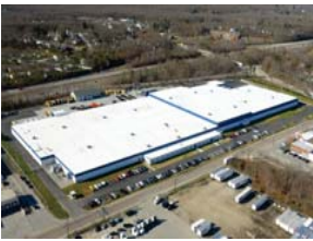
Cumberland, RI - Manufacturing Plant