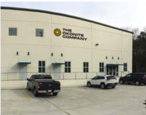
New Orleans, LA