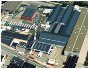
Paterson, NJ - Manufacturing Plant

Atlanta District Office (770) 928-9778 FAX: (770) 928-0913 E-Mail: atlanta@okonite.com Baton Rouge District Office (504) 467-1920 FAX: (504) 467-1926 E-Mail: batonrouge@okonite.com Birmingham District Office (205) 655-0390 FAX: (205) 655-0393 E-Mail: birmingham@okonite.com Boston District Office (603) 625-1900 (781) 749-3374 FAX: (603) 624-2252 E-Mail: boston@okonite.com Charlotte District Office (704) 542-1572 FAX: (704) 541-6183 E-Mail: charlotte@okonite.com Chicago District Office (630) 961-3100 FAX: (630) 961-3273 E-Mail: chicago@okonite.com Cleveland District Office (330) 926-9181 FAX: (330) 926-9183 E-Mail: cleveland@okonite.com Dallas District Office (940) 383-1967 FAX: (940) 383-8447 E-Mail: dallas@okonite.com Denver District Office (303) 772-3517 FAX: (303) 772-3513 E-Mail: denver@okonite.com Houston District Office & Service Center (281) 821-5500 FAX: (281) 821-7855 E-Mail: houston@okonite.com Kansas City District Office & Service Center (913) 422-6958 FAX: (913) 422-1647 E-Mail: kansascity@okonite.com Los Angeles District Office (562) 590-3070 FAX: (562) 590-3139 E-Mail: losangeles@okonite.com Minneapolis District Office (763) 432-3818 FAX: (763) 432-3811 E-Mail: minneapolis@okonite.com