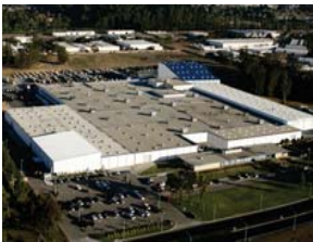
Santa Maria, CA - Manufacturing Plant