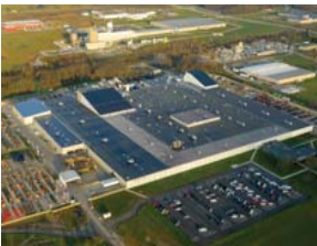
Richmond, KY - Manufacturing Plant