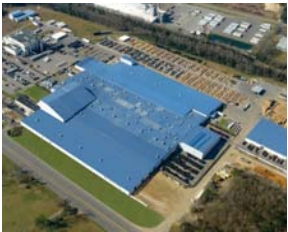
Orangeburg, SC - Manufacturing Plant