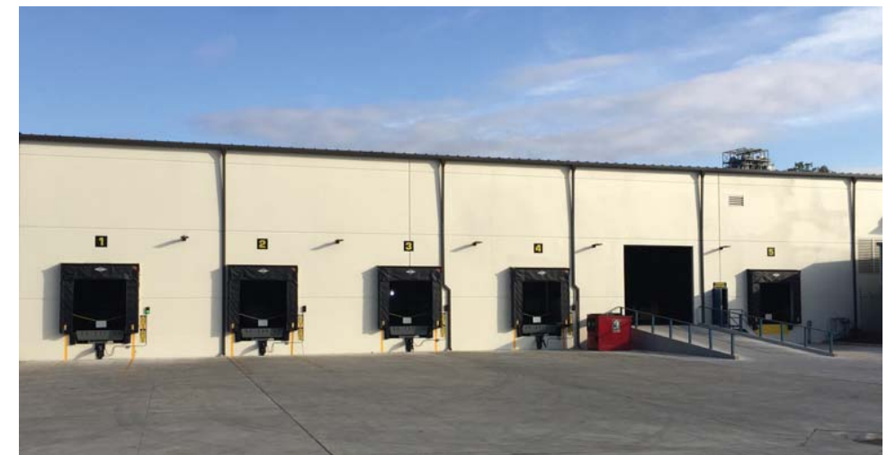
Loading docks with the latest technology for rapid handling of all orders.