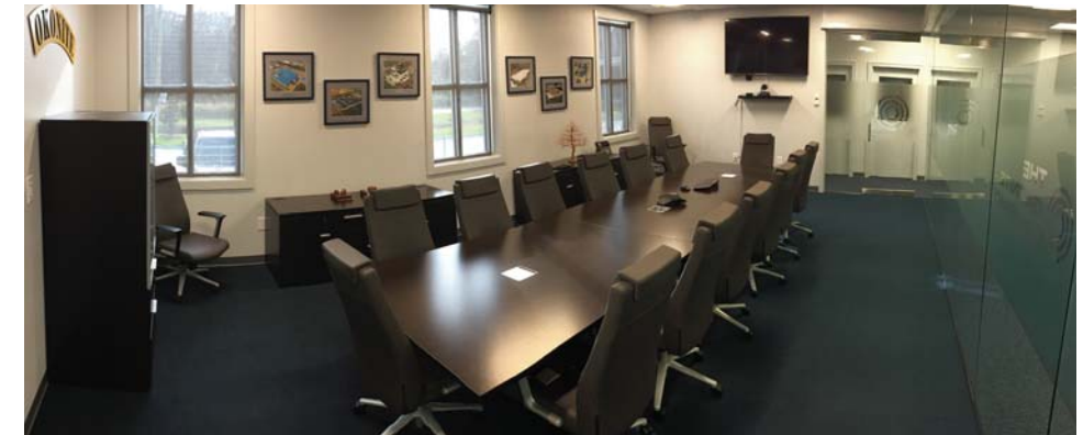
Large comfortable conference room for customer training and meetings.

These and other benefits should translate into continued excellent service and reduced overall cost to our customers. This is our response to those who have placed their confidence in Okonite reliability and customer service. You can count on the Okonite team to continue responding to all of your cable needs.