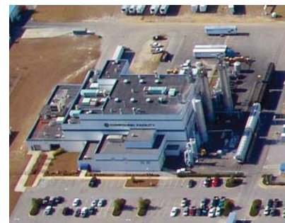
*Orangeburg, S.C - Compound Facility