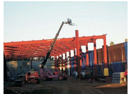
Low Bay Steel Expansion - Santa Maria