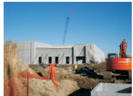
Service Center Construction - Kansas City