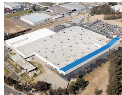
*Santa Maria, CA.