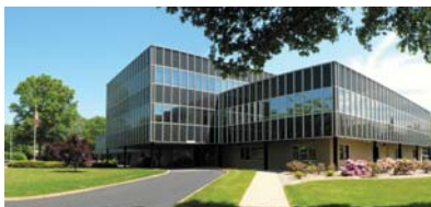
Corporate Headquarters, Ramsey, NJ

Houston Kansas City Pittsburgh New Orleans Portland Los Angeles