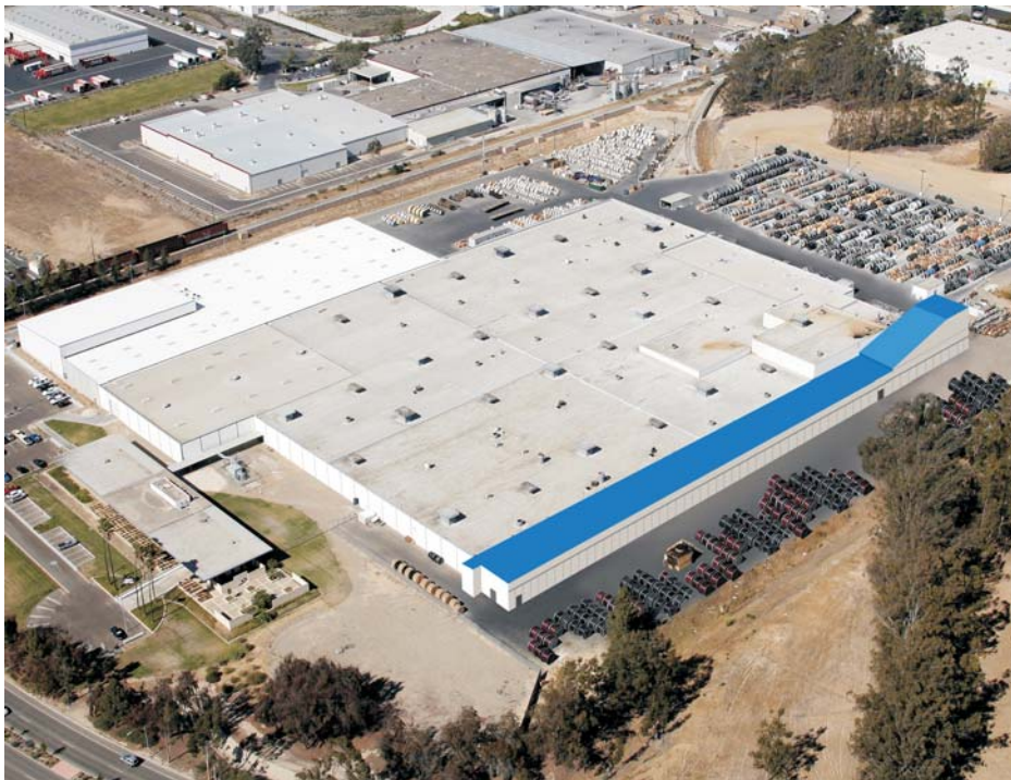
Aerial rendering (blue roof) of what the expansion would look like when completed - Santa Maria

As for our new Kansas City Service Center, when complete it will be identical to our recently completed Houston, Texas complex.