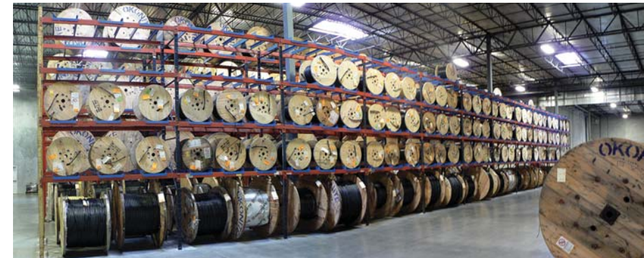
Vertical reels in our warehouse.