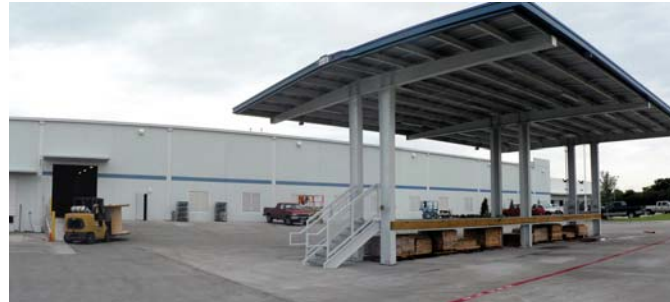
Our new cutting-edge outside loading dock.

Since opening our first Service Center in 1988, (35,000 square feet) we expanded to 50,000 square feet in 1995, and now our new facility is 80,000 square feet with four cutting lines. The New Houston Service Center expansion at our current location, was completed in February 2008 and became operational March 1, 2008.