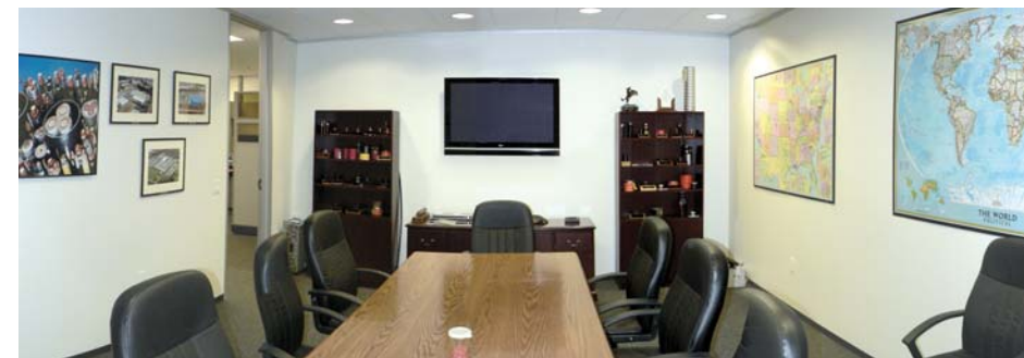
Our State-of-the-Art Conference room.