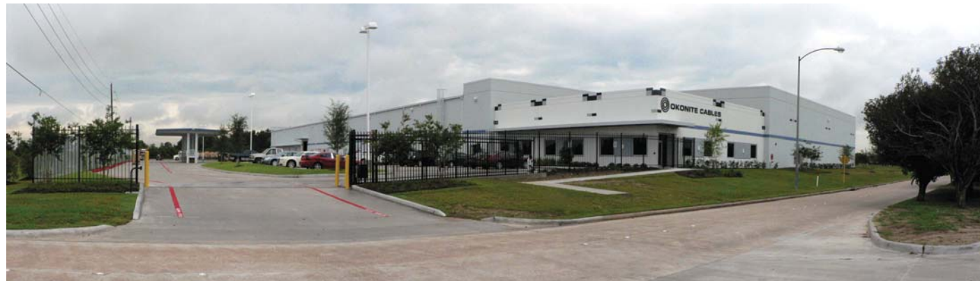
The main entrance to our recently opened 80,000 square foot facility on Century Plaza.