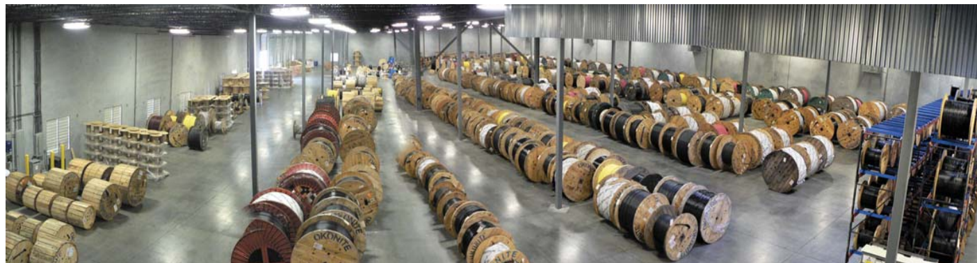
Our modern warehouse can now house the cable needed for the growing needs of our customers.